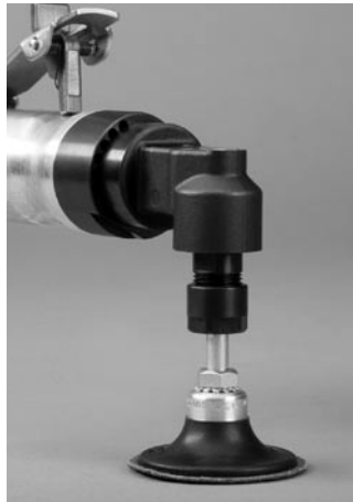
Front view of 280RAD/290RAD/330RAD/340RAD Series Tools

The ER Heavy Duty Collet Is Available On 280RAD/290RAD & 330RAD/340RAD Series