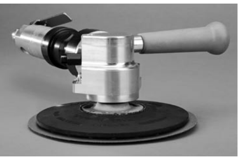
Front view of 4520RA/4527/4620RA/4627RA Series Tools